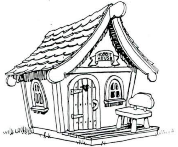
On the ground

This Hobbit House was inspired by the architecture of the houses shown in the Lord of the Rings trilogy, written during the mid-1900s. Although it is not built into the ground with a circular door, we think our design reflects the spirit of a Hobbit dwelling with its curved roof and funky windows. Its charm is in the “higgledy-piggledy” design that is purposely a little crooked.