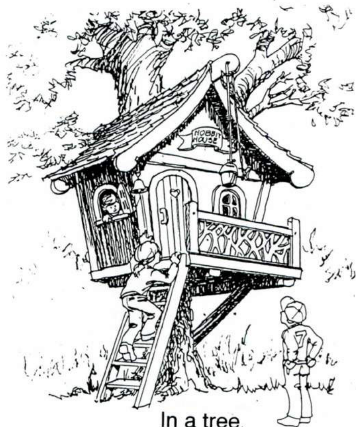
In a tree